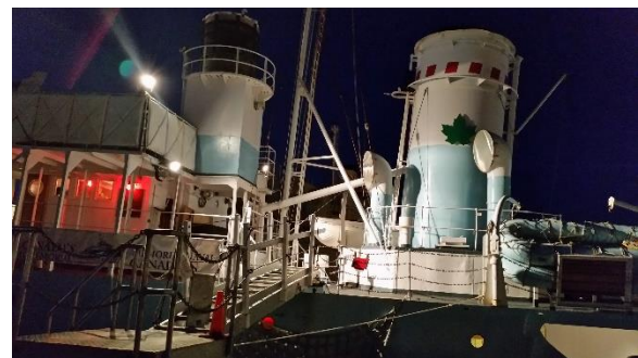
HMCS Sackville at night in the dockyard.