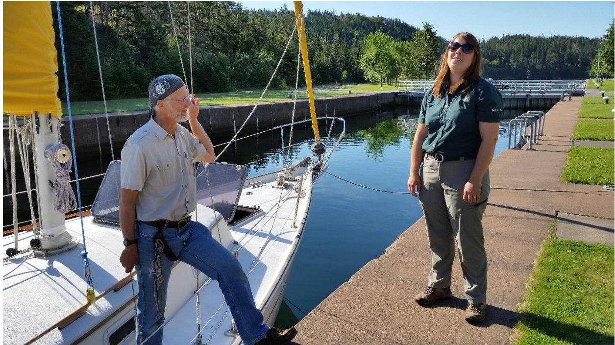
Locking through at St. Peters Canal.