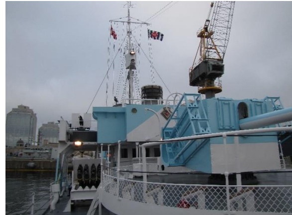
The Sackville flies the CPS-ECP flag.