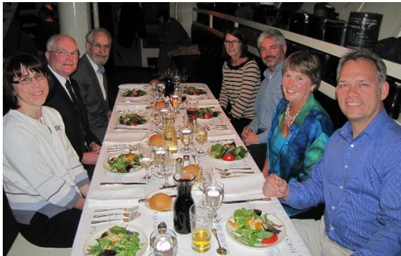
Aboard the HMCS Sackville for the Instructors Dinner, May 2011.

Each spring the Halifax Squadron of CPS-ECP thanks and honours its instructors with a dinner. Most years, this dinner is held onboard the HMCS Sackville , the second oldest commissioned vessel in the Royal Canadian Navy. The dinner is a chance to say “Thanks” to the many instructors who contribute their time for teaching and mentoring. The raison d'être of our Squadron and CPS-ECP in general is to help boaters learn about navigation, operations, and safety. Our instructors are at the forefront of this focus. I have attached photos from past dinners.