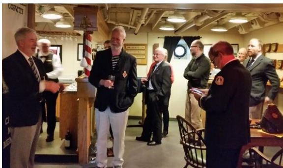
Cocktail and socializing time on board prior to dinner, 2015.